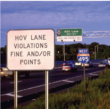
Future I-495 Express Lane, Virginia

HOT lanes provide mobility options for individual drivers while encouraging the use of transit and carpooling. Tolls collected from HOT lanes can supplement the operations, enforcement, and maintenance costs for the facilities. Even buses benefit from HOT lanes—research shows that communities with HOT lanes are often able to increase transit service as was the case with I-15 in San Diego. Solo drivers know they can count on getting where they need to be on time. For example, Minneapolis has increased the number of vehicles using the I-394 MnPASS lanes by 33 percent since the facility’s opening in 2005 without degrading transit and HOV use. Furthermore, travel speeds of 50 to 55 mph have been maintained for 95 percent of the time in the lanes. Denver originally projected 500 toll payers during the peak hour travel along I-25 but in fact achieved 1,400 in the first year of operation. Use of the I-25 HOT lanes has grown by almost 18 percent since the HOT lanes opened in 2006 and the lanes remain uncongested. Additionally, transit ridership in the HOT lanes has remained high.