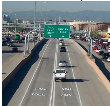
I-25 Express Lane, Denver

Like their HOV counterparts, HOT lanes have the potential to help improve air quality where they are implemented. High-occupancy lanes might help to reduce harmful impacts to the environment associated with congestion, especially by encouraging the use of multi-passenger vehicles or mass transit systems. On SR 167 in Seattle, general purpose lane speeds increased 10 percent and HOT lane speeds increased 7-8 percent and transit ridership increased 16 percent from the year before implementation of the HOT lane. As a result, the federal government allows HOV lanes to be considered a transportation control measure (TCM) for air quality conformity analysis.