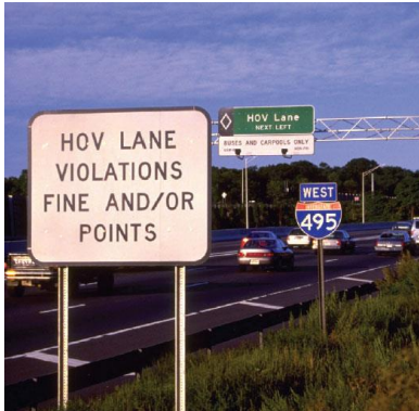
Future I-495 Express Lane, Virginia

HOT lanes provide mobility options for individual drivers while encouraging the use of transit and carpooling. Tolls collected from HOT lanes can supplement the operations, enforcement, and maintenance costs for the facilities. Even buses benefit from HOT lanes—research shows that communities with HOT lanes are often able to increase transit service as was the case with I-15 in San Diego. Solo drivers know they can count on getting where they need to be on time. For example, Minneapolis has increased the number of vehicles using the I-394 MnPASS lanes by 33 percent since the facility's opening in 2005 without degrading transit and HOV use. Furthermore, travel speeds of 50 to 55 mph have been maintained for 95 percent of the time in the lanes. Denver originally projected 500 toll payers during the peak hour travel along I-25 but in fact achieved 1,400 in the first year of operation. Use of the I-25 HOT lanes has grown by almost 18 percent since the HOT lanes opened in 2006 and the lanes remain uncongested. Additionally, transit ridership in the HOT lanes has remained high.