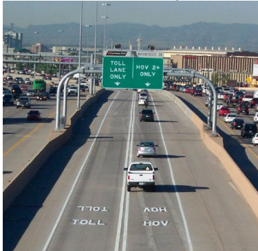
I-25 Express Lane, Denver

Like their HOV counterparts, HOT lanes have the potential to help improve air quality where they are implemented. High-occupancy lanes might help to reduce harmful impacts to the environment associated with congestion, especially by encouraging the use of multi-passenger vehicles or mass transit systems. On SR 167 in Seattle, general purpose lane speeds increased 10 percent and HOT lane speeds increased 7-8 percent and transit ridership increased 16 percent from the year before implementation of the HOT lane. As a result, the federal government allows HOV lanes to be considered a transportation control measure (TCM) for air quality conformity analysis.